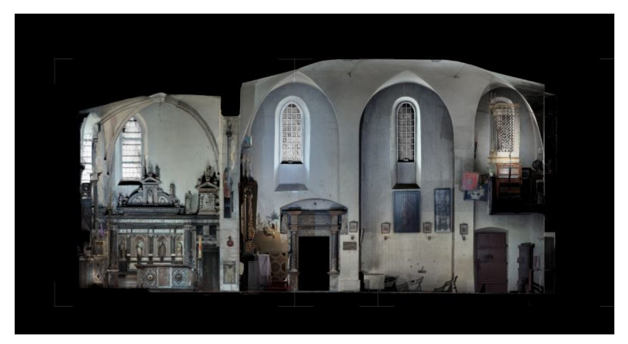
Fig. 2. Cracow, St Giles' church, longitudinal section showing the south wall; measurements and modelling: ArchiTube